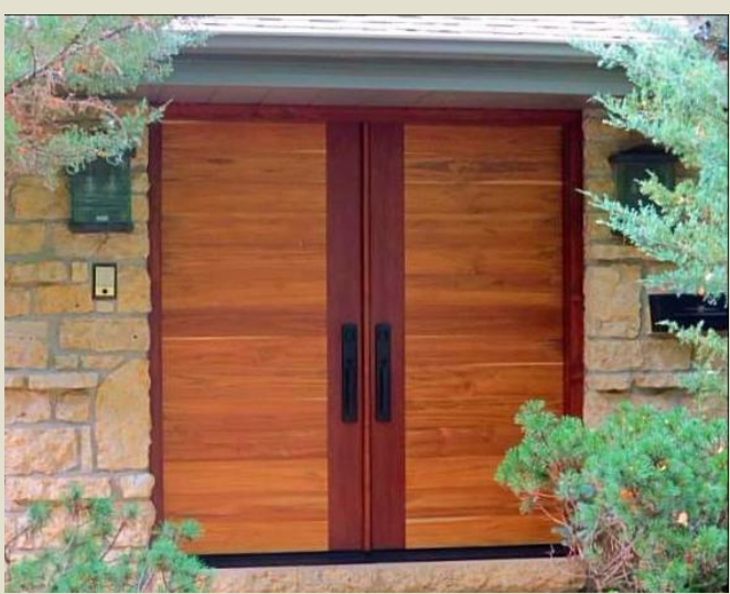
On the left, the before image. We removed a steel 1970s style door. On the right, the new doors.