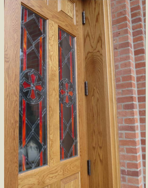
(Left) closer view of transom; (Right) closer view of stained glass pieces in door.