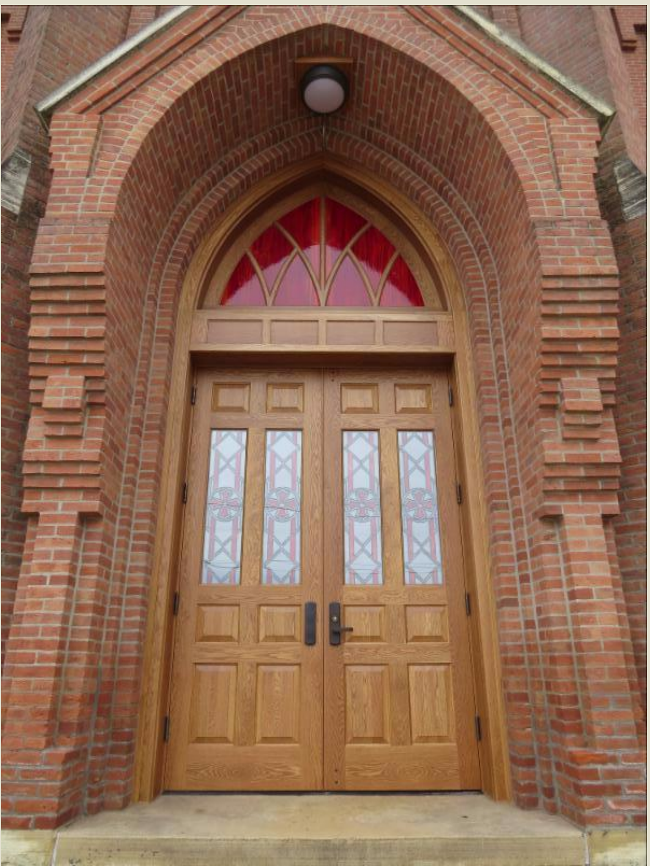
Full view of installed doors.