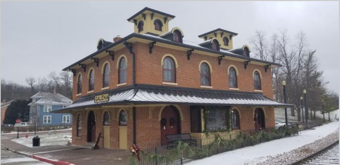
Installed Storm Windows on the Train Depot

Once received, the fit was checked and the storm windows were painted to match the sash. Due to most of the windows being half-round, there was no easy way to use traditional sash hangers. Instead, the contractor fastened the traditional storm windows in place with screws.