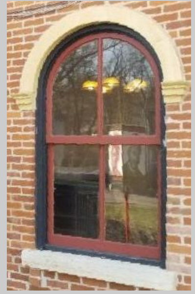
Before--Unprotected Primary Sash and Plexiglass Storms