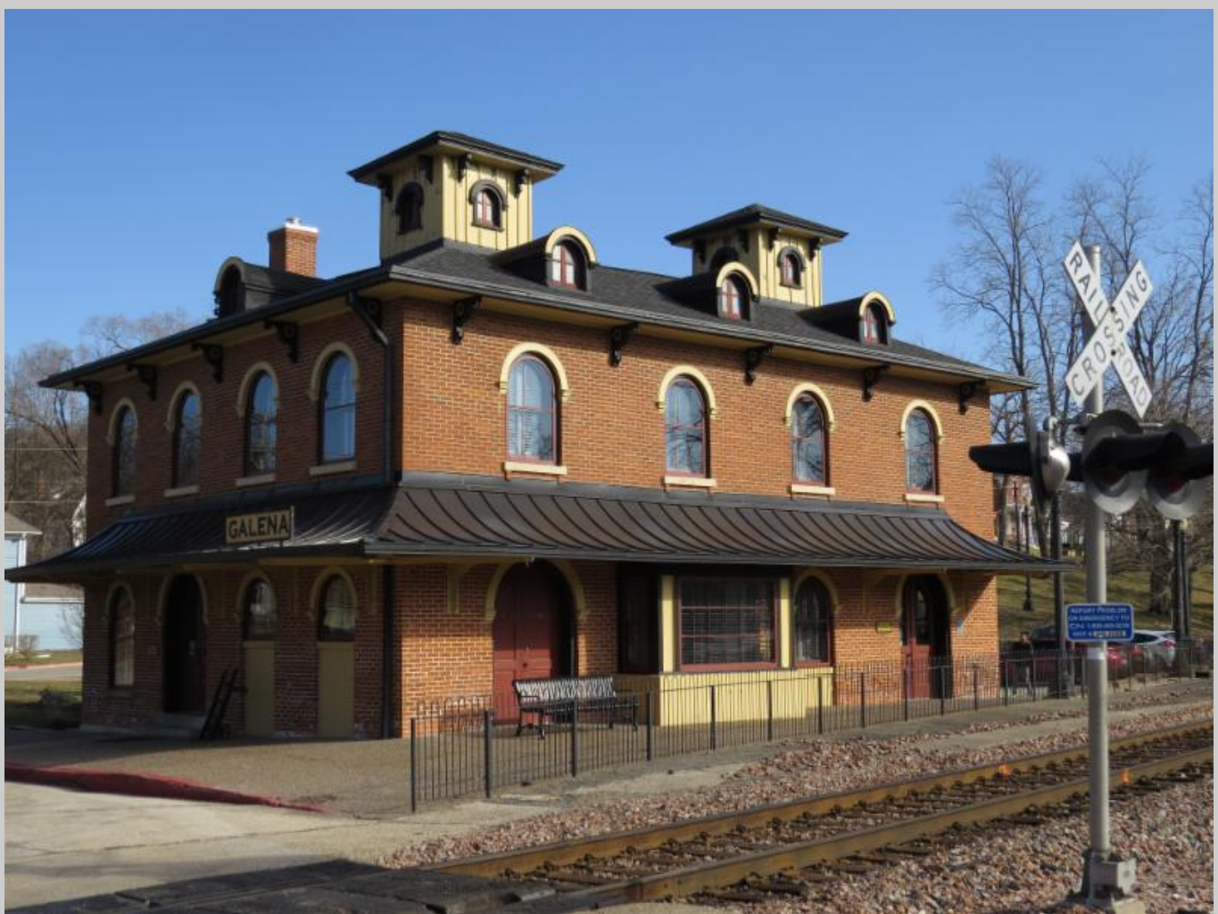
After--Storm Windows Affixed to Protect Sash and Provide Energy Efficiency

Our traditional storm windows are custom made to match the window configuration. Many of the windows have a half round top, for which we needed a template to ensure they would fit correctly when fabricated.