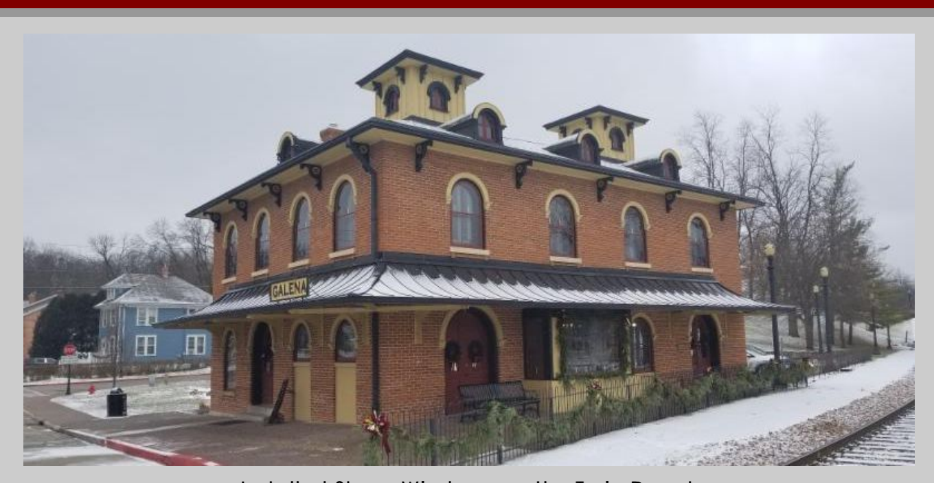
Installed Storm Windows on the Train Depot

Once received, the fit was checked and the storm windows were painted to match the sash. Due to most of the windows being half-round, there was no easy way to use traditional sash hangers. Instead, the contractor fastened the traditional storm windows in place with screws.