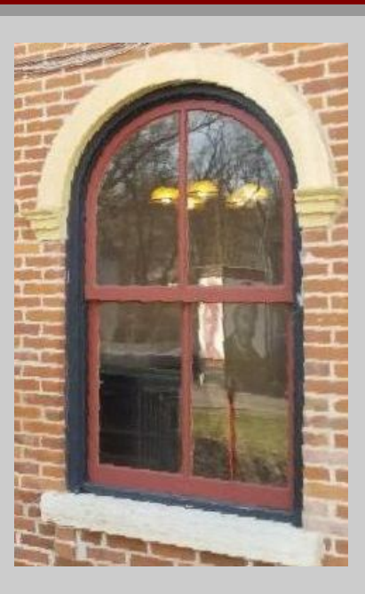
Before--Unprotected Primary Sash and Plexiglass Storms