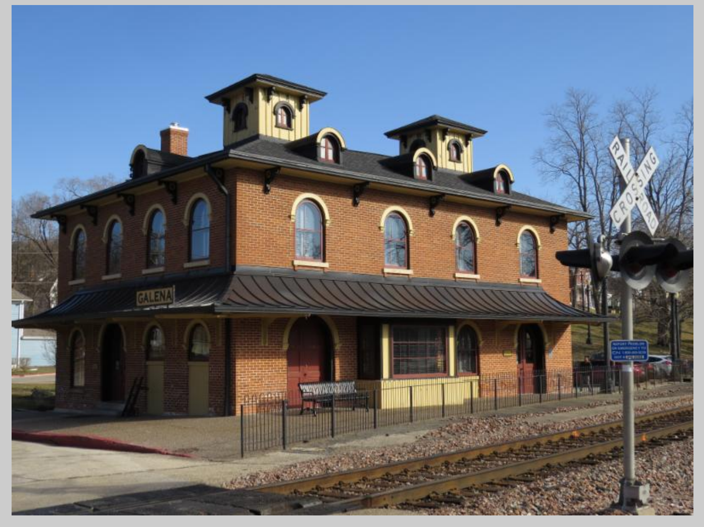
After--Storm Windows Affixed to Protect Sash and Provide Energy Efficiency

Our traditional storm windows are custom made to match the window configuration. Many of the windows have a half round top, for which we needed a template to ensure they would fit correctly when fabricated.