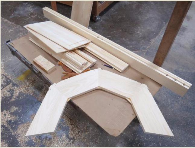
Components for Assembly

An arched top always brings a challenge to ensure that it matches the existing opening. We were able to keep the door that was being replicated and could check the radius as we were working to ensure accuracy. This door makes a unique and memorable entrance to the home. The use of both glass and raised wood panels gives the door interest and allows light to enter the residence through the divided lite glass with a round top.