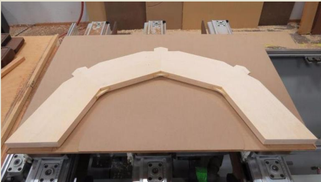
Ready for the CNC

An arched top always brings a challenge to ensure that it matches the existing opening. We were able to keep the door that was being replicated and could check the radius as we were working to ensure accuracy. This door makes a unique and memorable entrance to the home. The use of both glass and raised wood panels gives the door interest and allows light to enter the residence through the divided lite glass with a round top.