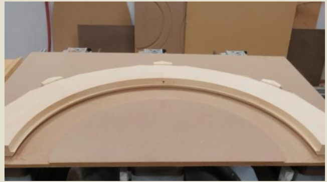
First pass through the CNC cuts the inside routing