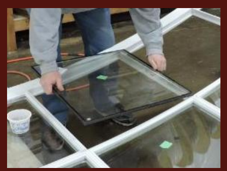
Dry fitting the glass to ensure proper fit