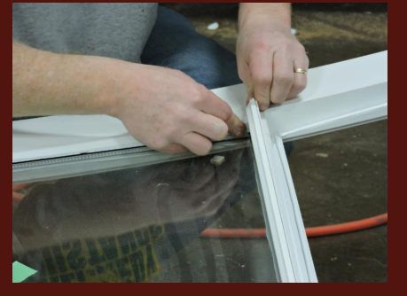
Placing wood stops