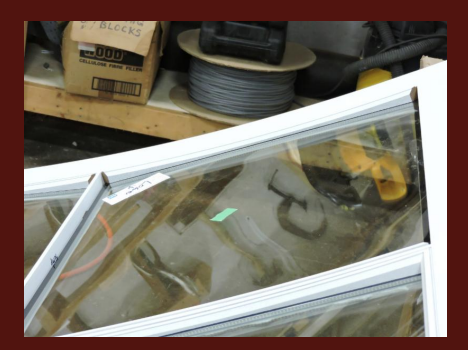
Glass in place