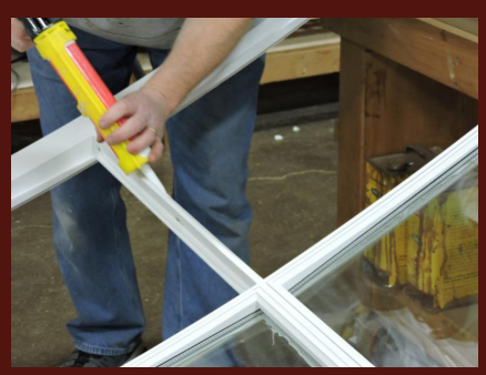
Caulk to guarantee seal of window to avoid leaks