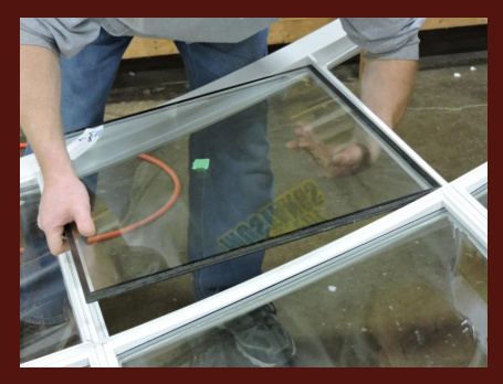
Placing glass into divided lite space