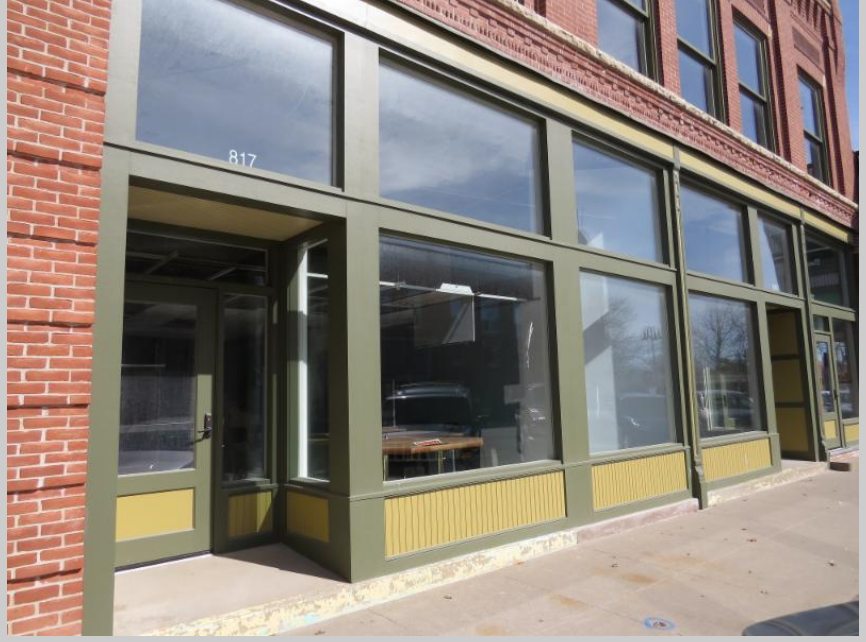
CLOSER VIEWS OF THE DOORWAY AND STOREFRONT