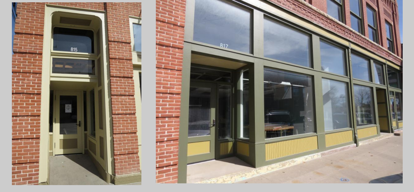
CLOSER VIEWS OF THE DOORWAY AND STOREFRONT