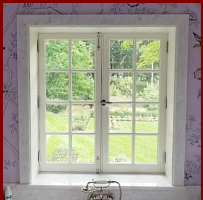
View from Interior

A few additional window styles are depicted here as well to show the capabilities of our shop: