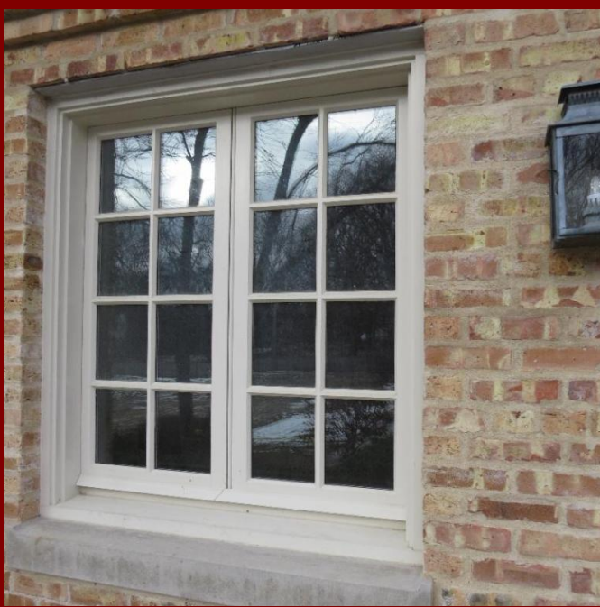
View from Exterior