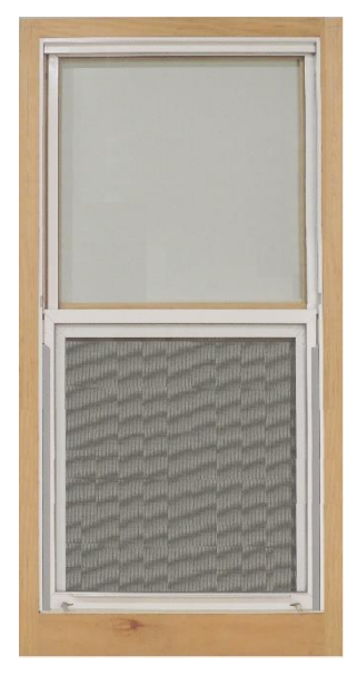
Self-Storing Storm VIEW FROM INTERIOR