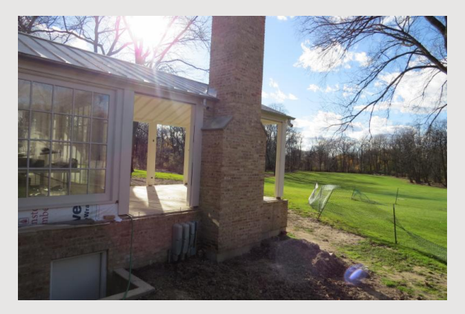
Mid-construction of the screened area.

The divided lite window and doors were used to separate the casual eating area from the three seasons room giving the area an atrium feeling. The full height SImpleSwitch windows create a bright airy space that allows for the screen inserts to be removed when the temperatures drop. The tempered glass inserts stretch out the porch season with living and entertaining space.