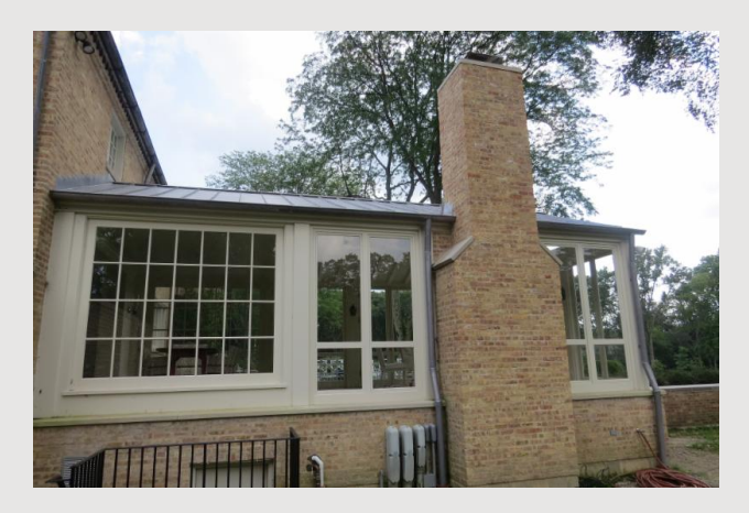
Finished construction with SimpleSwitch windows.