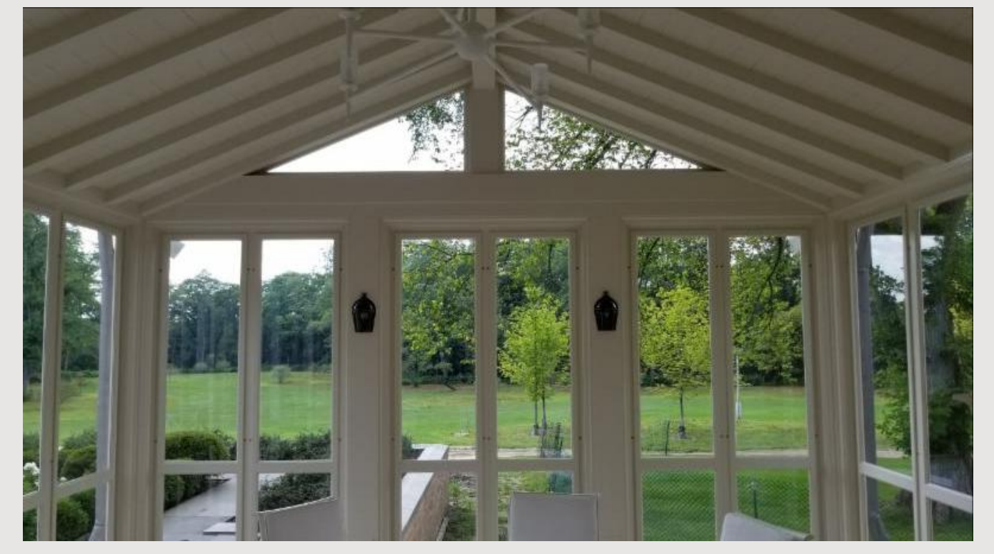
View out from interior of three seasons area