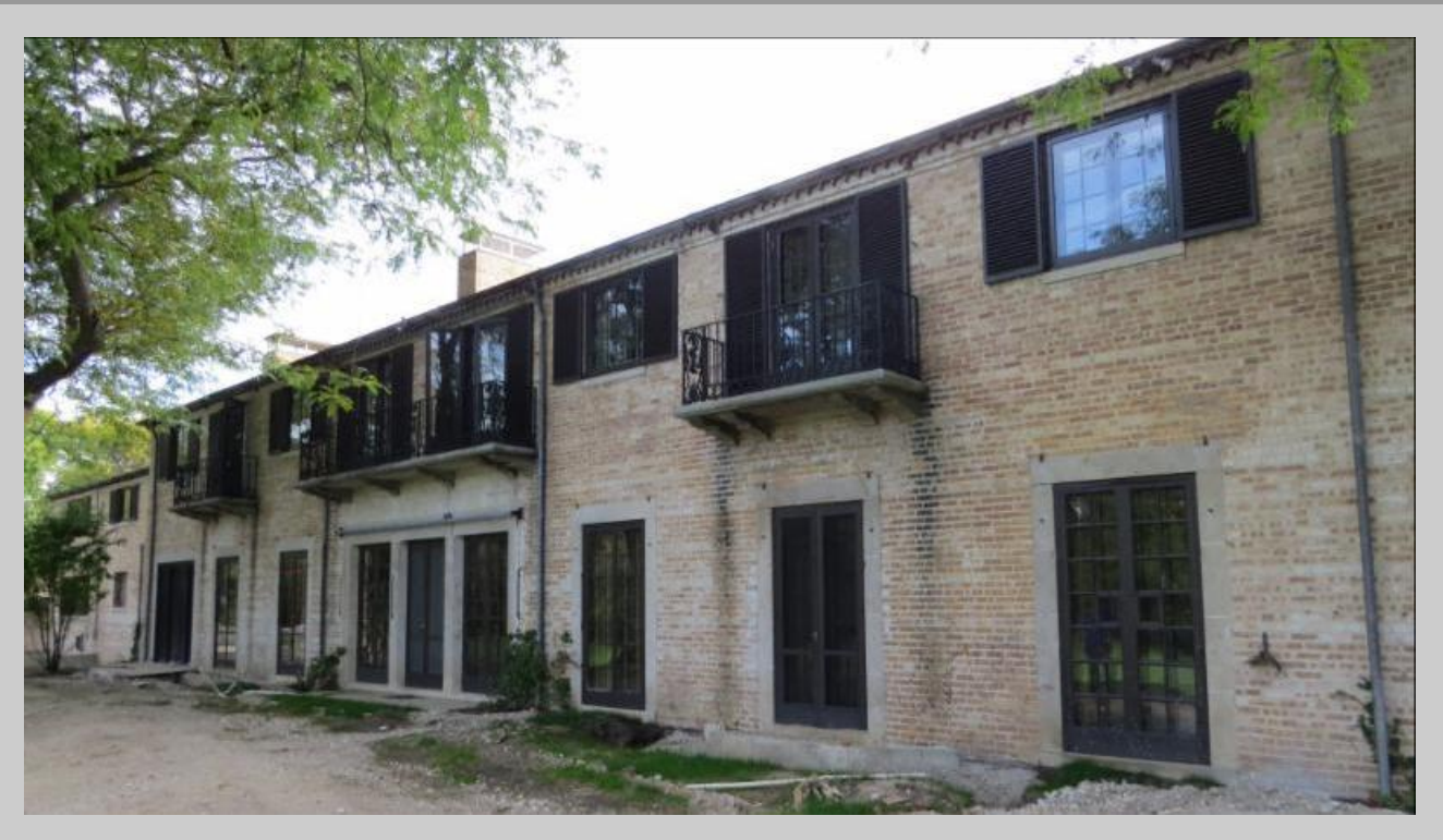
Before Addition (Added to far left of photo)

A continuation of the full house project, we are focusing on the addition that included a three season room and casual eating area. The owner wanted the addition to be consistent with the look of the original house while meeting their needs.