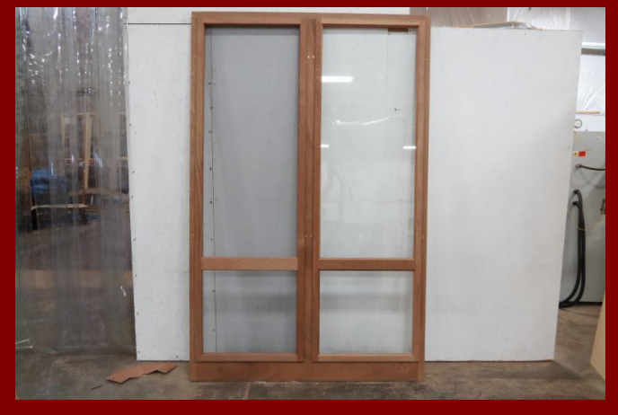
SimpleSwitch windows: screen insert to the left & storm insert to the right.

We worked closely with the contractor to ensure the angles used on the triangular windows at the peak were the correct angle. The interior doors contained 8 divided lites and the picture windows contained either 24 or 28 lites. The design of the windows and doors allows abundant light to fill this addition!