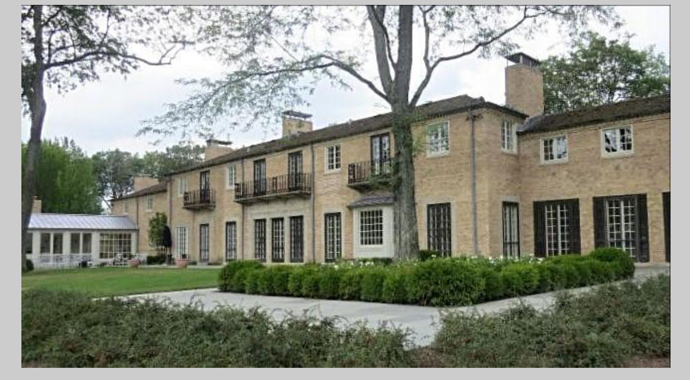
After Addition (Visible at far left of photo)