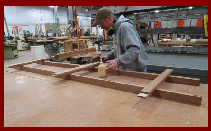
Assembling the inserts.