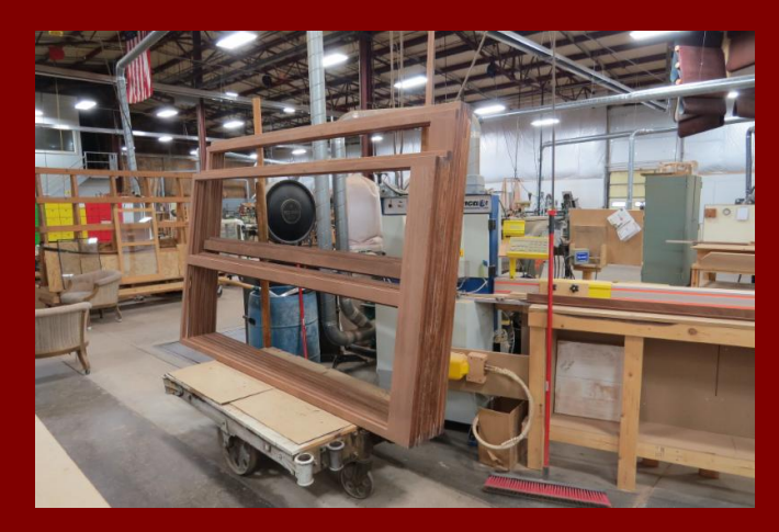
Windows without inserts.