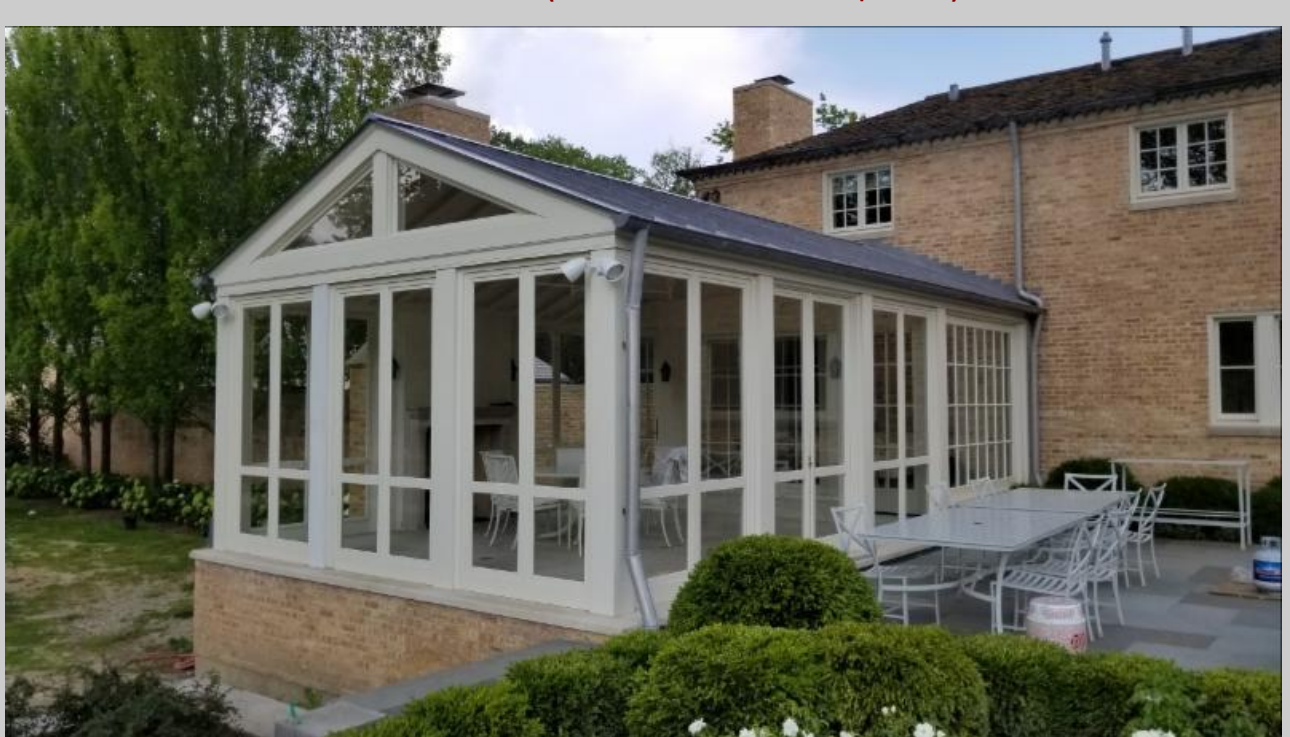
Closer view of completed three seasons porch addition

Wanting to maintain the same feel and look as the existing house, we fabricated windows for the addition to complement the rest of the house. Mahogany was again used for fabrication. Large SimpleSwitch windows were used so that the home owner can switch between storm panels and screen panels. [We fabricated our SimpleSwitch Screen Door with Storm Insert as a window for this application.] Insulated glass was incorporated in the doors and window between the casual eating area and the three season area.