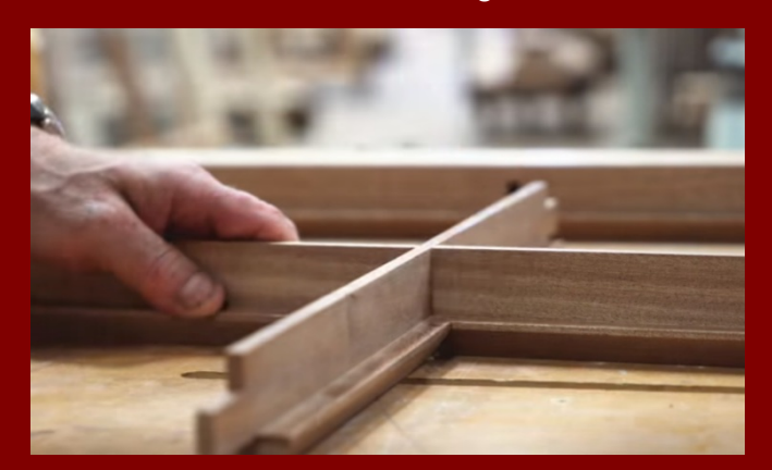
Divided lites in the interior doors.