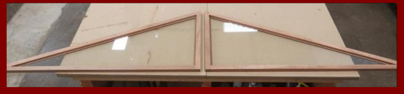
Triangle windows found at the peak of the addition.