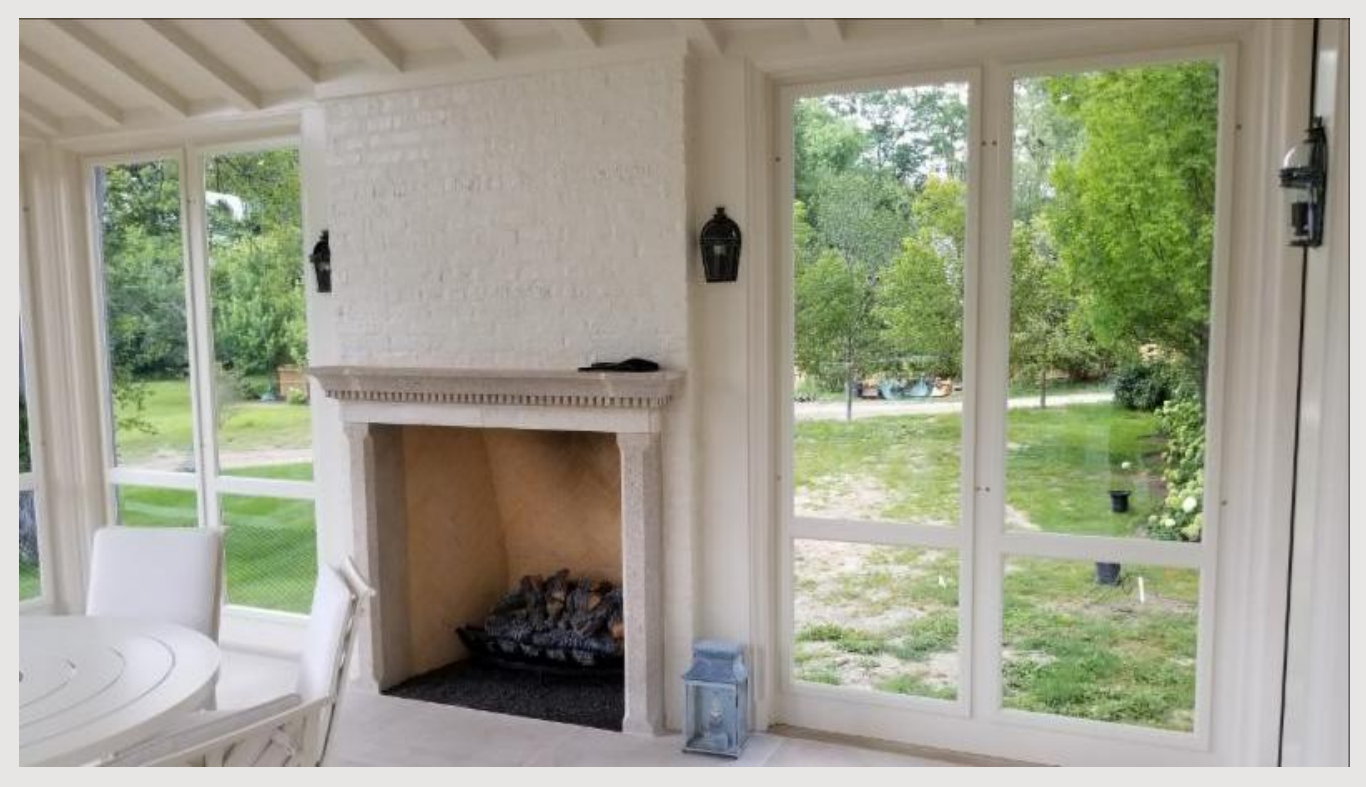
View of SimpleSwitch with the storm panels from the interior