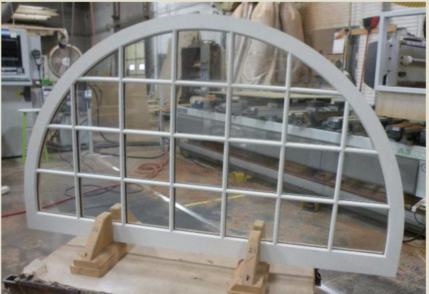
Windows Being installed and Completed Photos