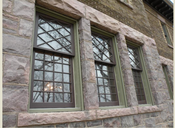
Divided lites in the main level showing both traditional and diamond styling.