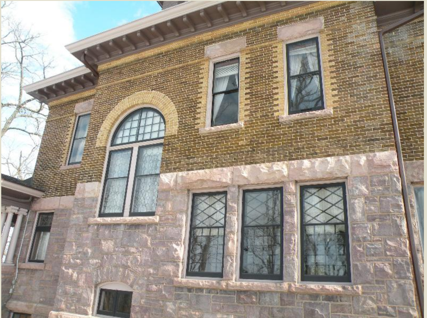
A closer view of the existing windows.