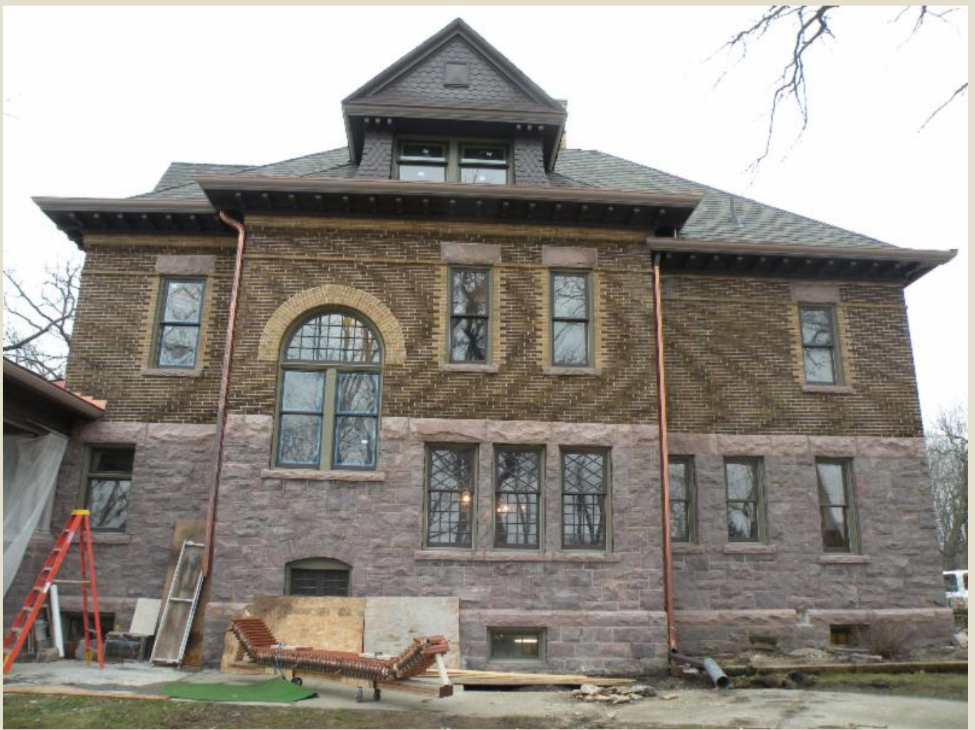
View with new windows installed.