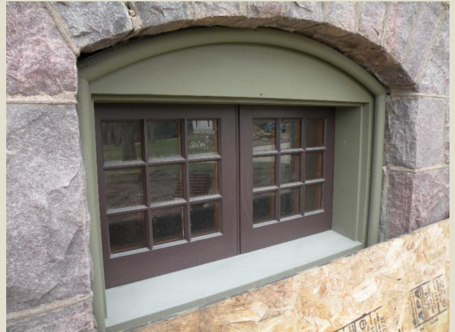
Casement windows in the main level.