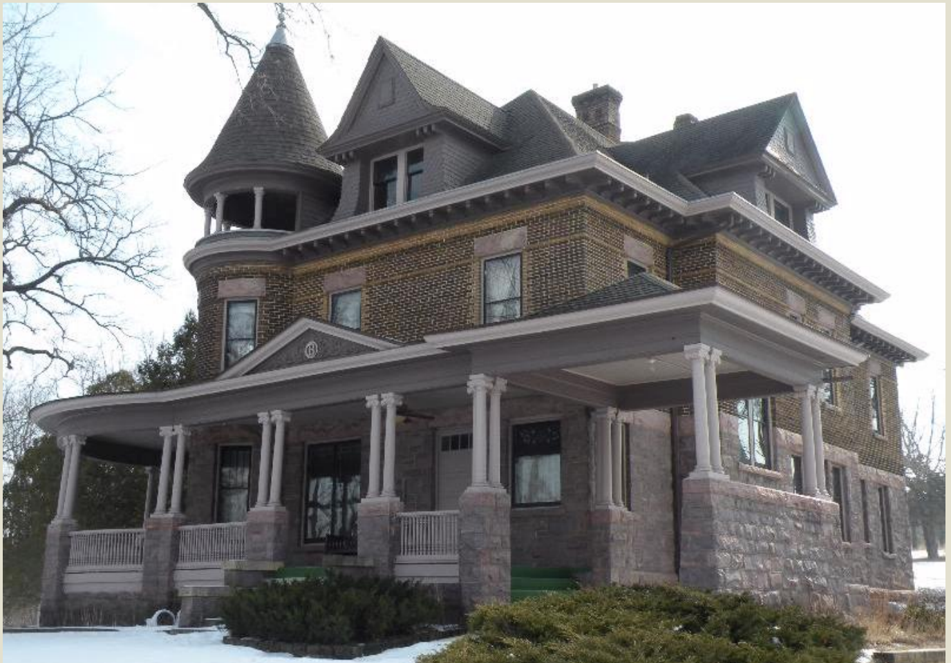
Before photo, showing original windows.

The homeowner wanted to keep the same look as the original windows, but wanted the efficiency of insulated glass. To preserve the same look as the original, we had to fabricate a thicker window sash to maintain the same depth of the muntin bar.