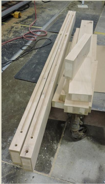
Stiles and rails waiting for assembly.

Our CAD drafter creates a 3-D drawing of every door that we make. It is provided to each customer for approval before fabrication. Using the CAD system, we can see what the finished door will look like and it provides us with accurate specifications for the shop.