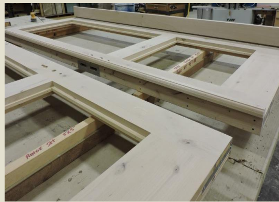
Stiles and rails glued up.

Fairly easy to work with, Knotty Alder is a wood specie where you need to be mindful of the end cuts so that it does not split. We were also diligent in selecting cut lines in order to avoid knots along the edges. This custom door is made more unique with the knots and whorls in the wood grain.