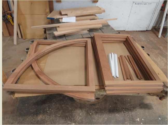
Completed Frame of the Quarter Round Window (left)