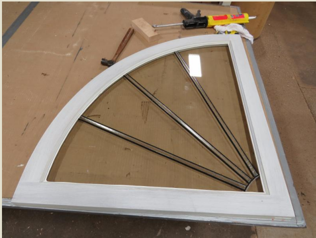
Construction of the Window with Spacers Visible