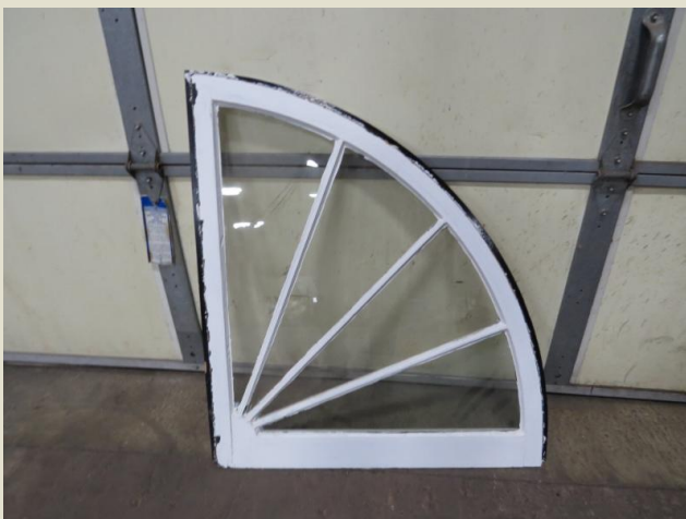
Existing Quarter Round Window

There were a number of different elements that we provided for this renovation, including 43 energy-efficient double-hung windows with low-E insulated glass and divided lites fabricated from African mahogany, quarter circle windows, entry doors, interior doors, and brickmould.