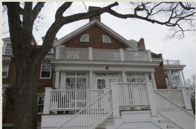
View of the Residence Facing the Iowa River