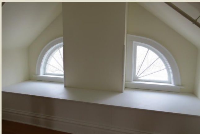
View of the Quarter Round Windows from the Interior