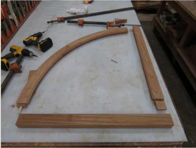
Assembling the Frame

placement that we designed to match the existing windows.