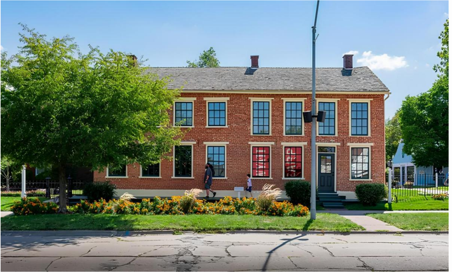
Wyatt Earp | Pella Historical