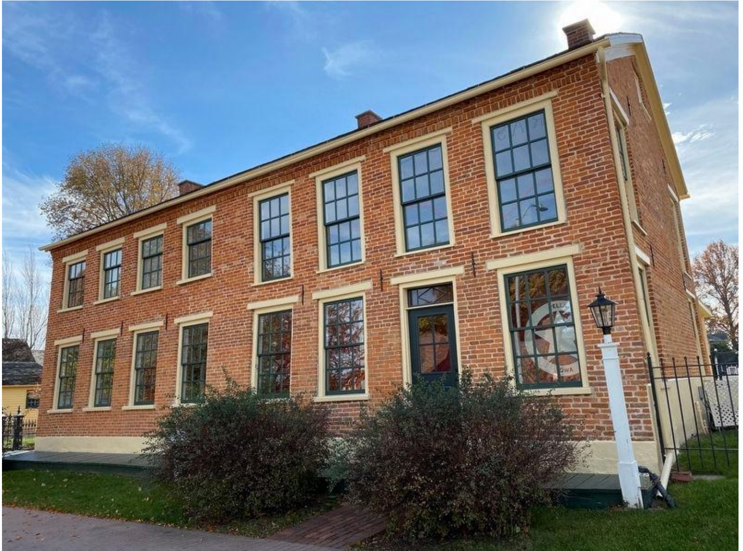
Historical Marker Database | Wyatt Earp House

Some of the finished product images that depict these gorgeous true divided lite windows are included below.