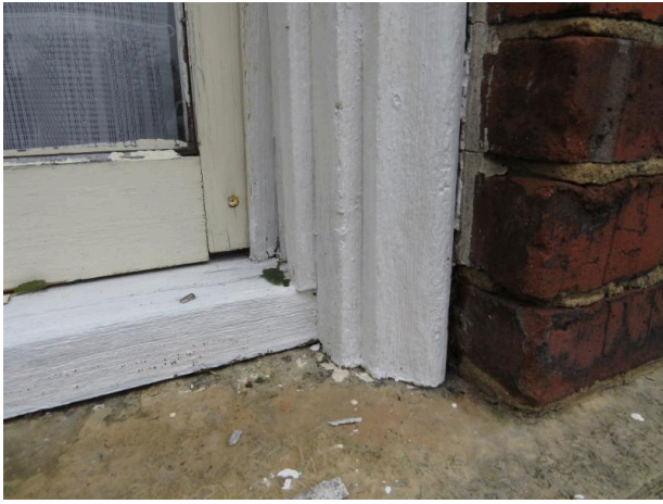
Picture of the original sill, frame, and brickmould.