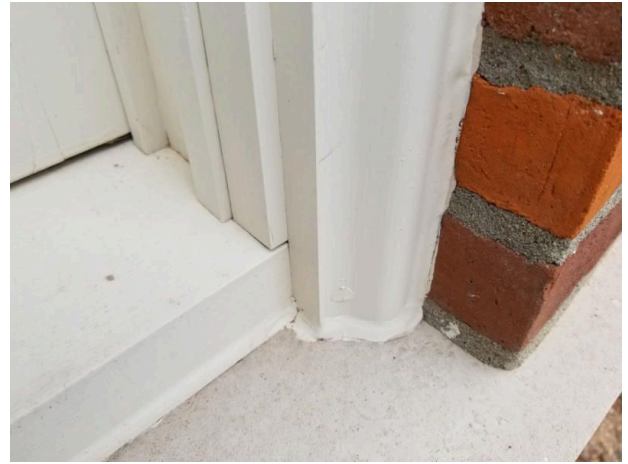
New sill and jamb. We also had knives ground to match the original brickmould.

In addition to the four windows, we also fabricated brickmould that was recreated to match the original. The half-round top of the brickmould perfectly matches the half-round of the top sash as well as the masonry opening. You can tell that the Buchanan County Historical Society has worked diligently to restore the formal, yet gracious building into a worthy listing on the National Register of Historic Places.