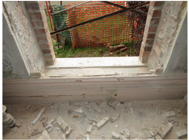
This is the picture of the sill where the new window will sit.