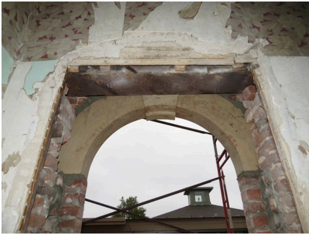
This picture shows the inside of the opening. The window is square on the inside and has a radius on the exterior.